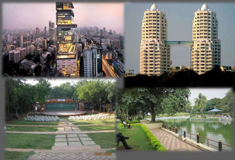
POST MODERN ERA - INDIA