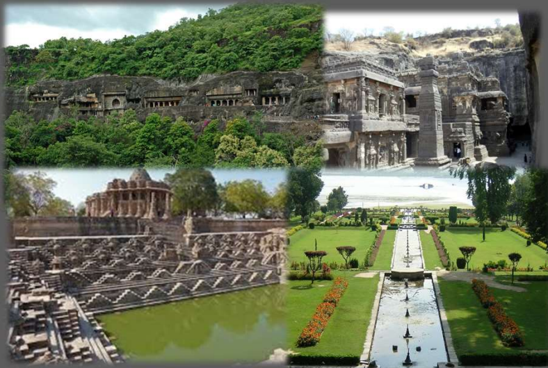
PRE MODERN ERA - INDIA