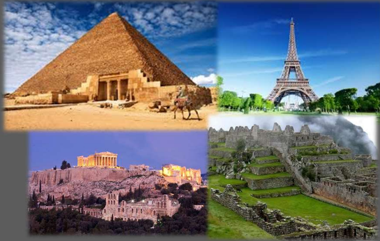
PRE MODERN ERA - WORLD