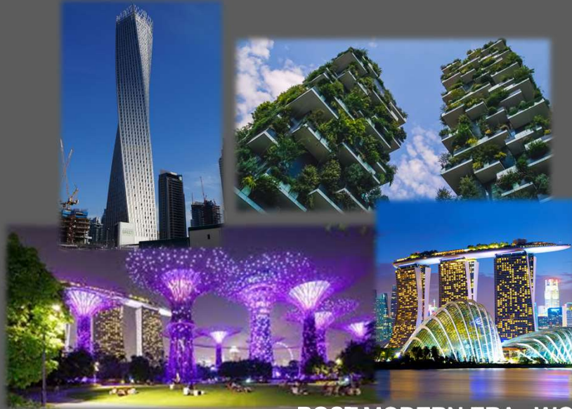
POST MODERN ERA - WORLD